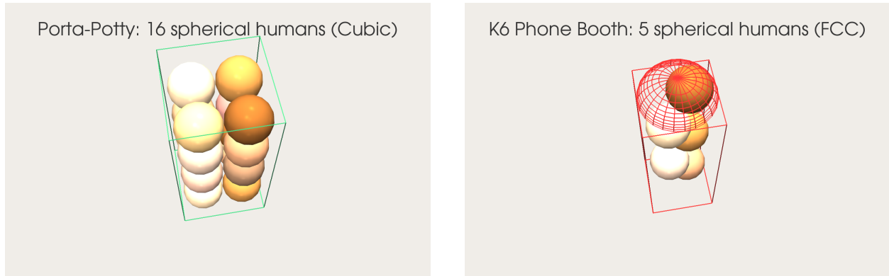
Figure 2: Left: 16 Meatball spheres in a PolyJohn PJN3 porta-potty (cubic lattice). Right: 5 Meatball spheres in a K6 telephone booth (FCC). The world record for the K6 is 25 real humans.